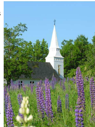
St. Matthew's Chapel